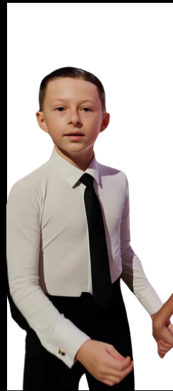
Juvenile Ballroom (Tie)