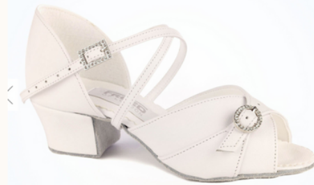
JUVENILE - UNDER 12 SHOES

Please see below examples of the kind of shoes needed: